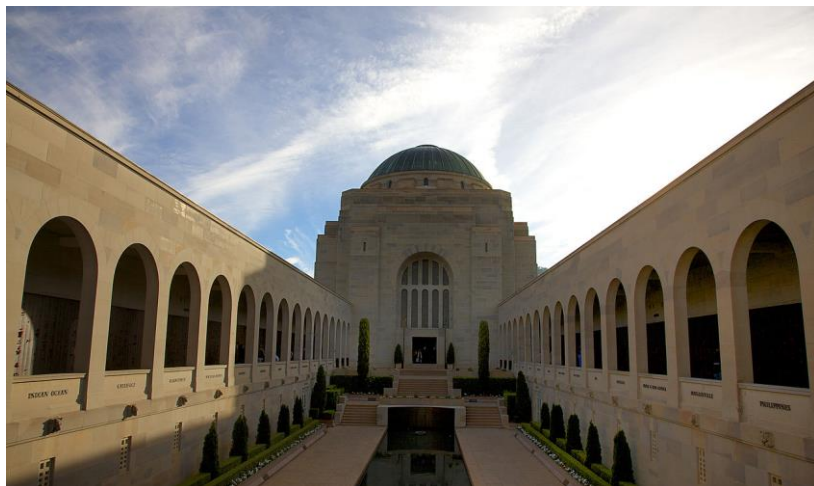
Commemorative Area of the Australian War Memorial